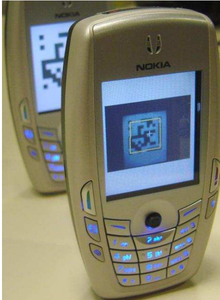
Figure 4. SiB application on a Nokia 6620 with one phone scanning the hash-barcode on the LCD of another.