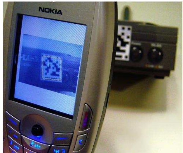
Figure 3. Phone running SiB scanning a barcode on an 802.11 access point.

Another commonly considered application where demonstrative identification of communicating devices is desirable is when using a printer in a public place. Similar to the wireless access point, the printer can have a barcode affixed to its housing so that a user can use SiB to authenticate wireless communication with the printer/print server and bootstrap establishment of a secure connection. Secure communication is important here not only to ensure the secrecy of the printed document, but to protect the user's computer from malicious software that masquerades as a printer driver.