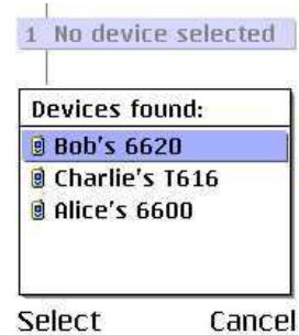
(a) Device selection.