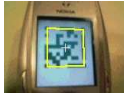
(b) Barcode recognition.

For example, a 1024 bit RSA key would need to be encoded in 16 barcodes in our current implementation—64 bits of key and 4 bits of place-marker in each barcode.